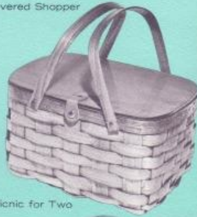
Picnic for Two